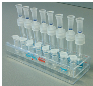
Reference photo: placing the columns and receiving tubes in the Gravity flow rack.